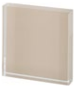
COD / TEA1 IVORY