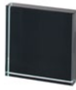
COD / TRN2 ANTHRACITE