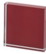
COD / TRR1 RED