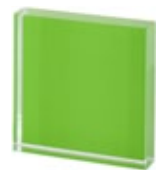
COD / TEV1 GREEN FLUO