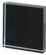
COD / TRN1 BLACK