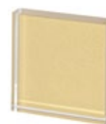
COD / TEM4 EXTRALIGHT GOLD