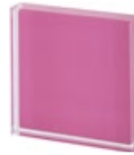
COD / TER3 PINK