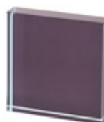
COD / TRM3 AUBERGINE