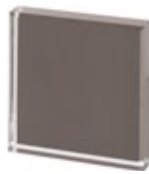
COD / TEC2 CLAY