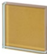
COD / TRM1 GOLD