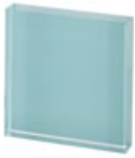
COD / TRB2 AQUAMARINE