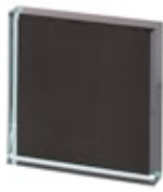
COD / TRC1 MOCHA