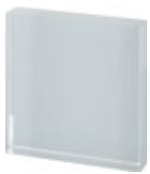
COD / TEB1 MILKY WHITE