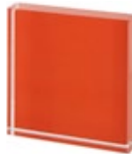
COD / TER2 ORANGE