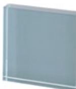
COD / TRM2 ALUMINIUM