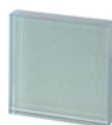
COD / TEM5 EXTRALIGHT ALUMINIUM