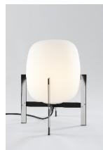
Cesta Metálica NEW PRODUCT 2015