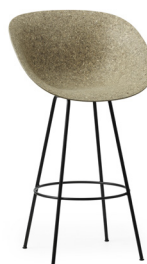
Mat Bar Armchair 75 cm