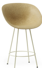
Mat Bar Armchair 65 cm