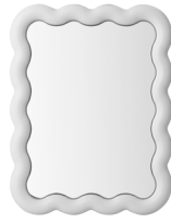
Illu Mirror 65 x 50 cm H: 65 x L: 50 x D: 5 cm