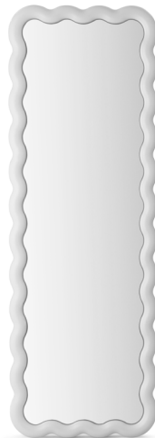
Illu Mirror 160 x 55 cm H: 160 x L: 55 x D: 5 cm