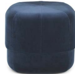
Circus Pouf small Dark Blue