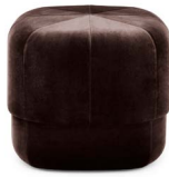
Circus Pouf small Coffee