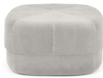
Circus Pouf large Beige