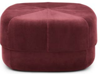
Circus Pouf large Dark Red