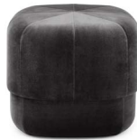
Circus Pouf small Grey