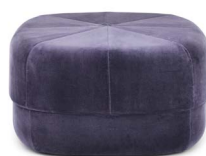
Circus Pouf large Purple

Color: Rust, Yellow, Light Blue, Dark Blue, Purple, Blush, Dark Red, Grey, Beige, Electric Blue and Coffee