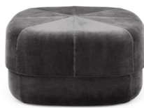
Circus Pouf large Grey