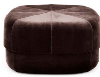
Circus Pouf large Coffee