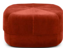
Circus Pouf large Dark Red