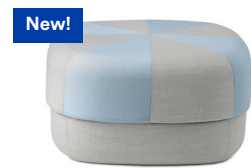
Circus Pouf small Light Blue