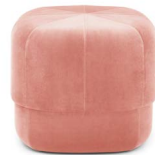
Circus Pouf small Blush