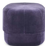
Circus Pouf small Purple