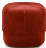
Circus Pouf small Dark Red