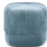
Circus Pouf small Light Blue