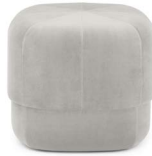
Circus Pouf small Beige