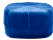
Circus Pouf large Electric Blue