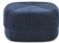
Circus Pouf large Dark Blue