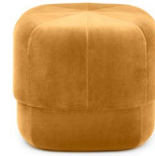
Circus Pouf small Yellow