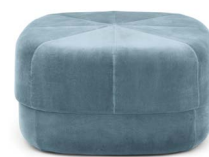
Circus Pouf large Light Blue