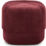
Circus Pouf small Dark Red