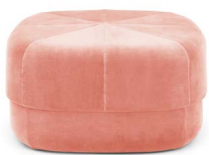
Circus Pouf large Blush