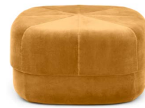
Circus Pouf large Yellow