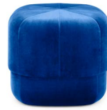
Circus Pouf small Electric Blue