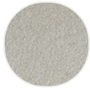
Cement natural X032