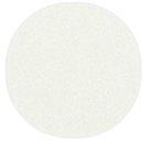
Matt lacquered white X042