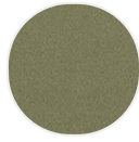
Matt lacquered green X049