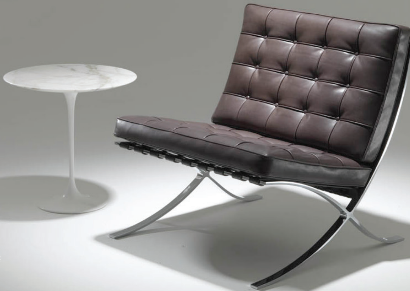
Barcelona® Chair - New Comfort Ludwig Mies van der Rohe