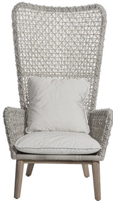
PANDA / BERGERE ARMCHAIR, Paola Navone

Important proportions characterise the Bergere Panda 19 chair, with armrests and an oversized backrest that develops with a considerable height. It is made with a structure and feet in aluminium and weave in white/grey Panda Resin synthetic polyethylene fibre. Synthetic fibres of the latest generation designed to resist water and light and to maintain over time the technical and chromatic qualities, maintain a very natural and durable appearance. The seat and backrest are enriched with oversized cushions with removable upholstery for accentuated comfort.