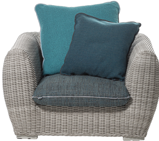
PANDA / ARMCHAIR, Paola Navone

Soft and welcoming shapes and consistent volumes characterise the Panda 05 armchair; it has a structure and feet in aluminium and weave in white/grey Panda Resin synthetic polyethylene fibre. Synthetic fibres of the latest generation designed to resist water and light and to maintain over time the technical and chromatic qualities, maintain a very natural and durable appearance. The seat and backrest are enriched with oversized cushions with removable upholstery for accentuated comfort.