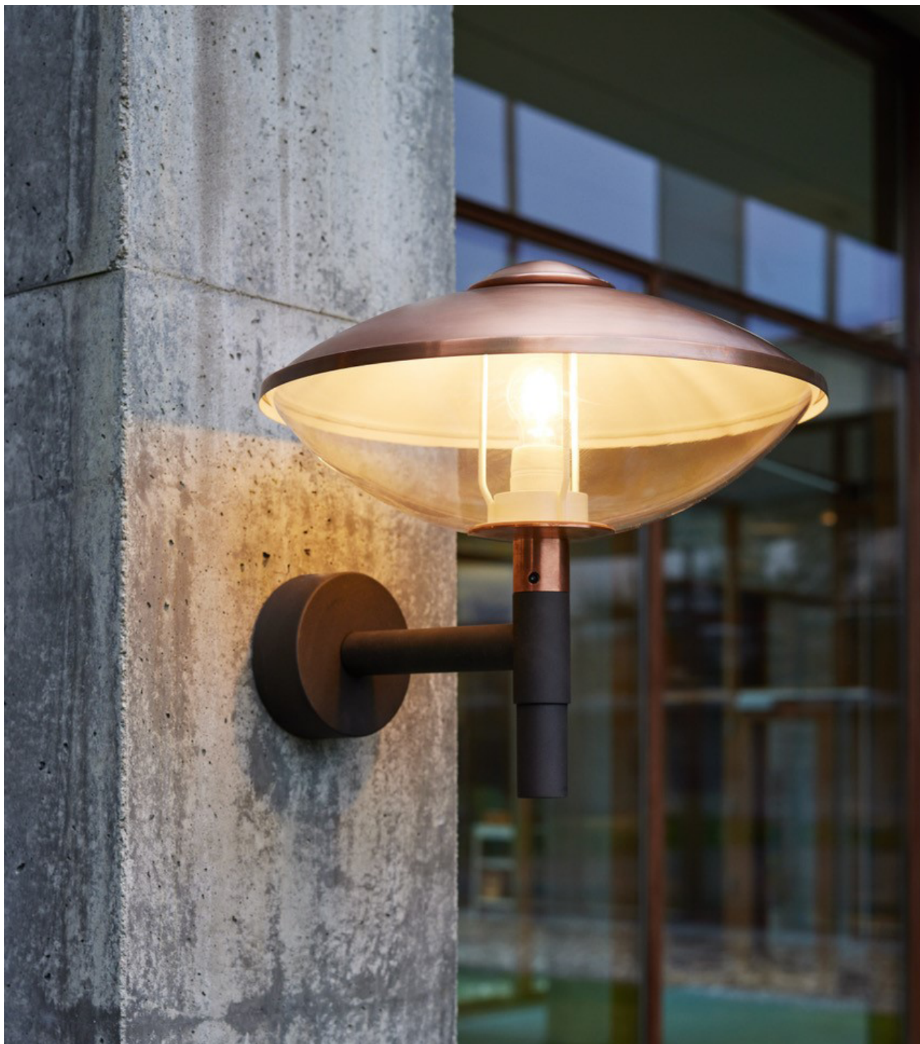
HL WALL PRODUCT FACT SHEET