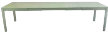
5222 - TABLE WITH 3 EXTENSIONS XL 149/299 X 100 CM