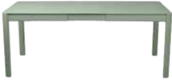
5220 - TABLE WITH 1 EXTENSION 149/191 X 100 CM