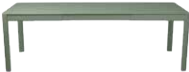
5221 - TABLE WITH 2 EXTENSIONS 149/234 X 100 CM