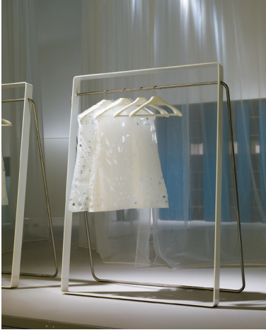
design Duccio Grassi

A practical and elegant clothes hanger which can stand everywhere; it is folding and can be put also in very narrow spaces, in a house, in a office but also in a shop.