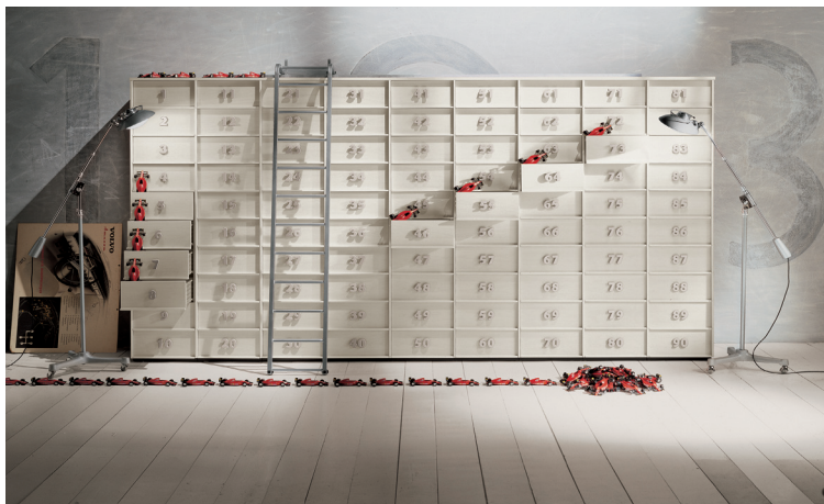
design Pietro Arosio

Nice and always modern, Toolbox can be composed in many different combinations, with different finishing and dimensions.