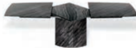
SOCKEL 5/BASE 5