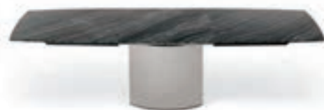
SOCKEL 2 (STANDARD)/BASE 2 (STANDARD)