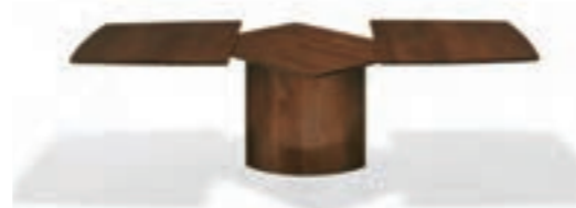
SOCKEL 5 / BASE 5