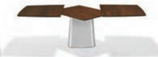
SOCKEL 7/BASE 7