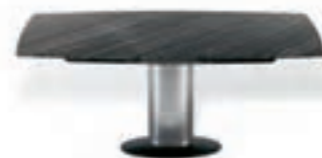
SOCKEL 4/BASE 4