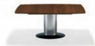
SOCKEL 4/BASE 4