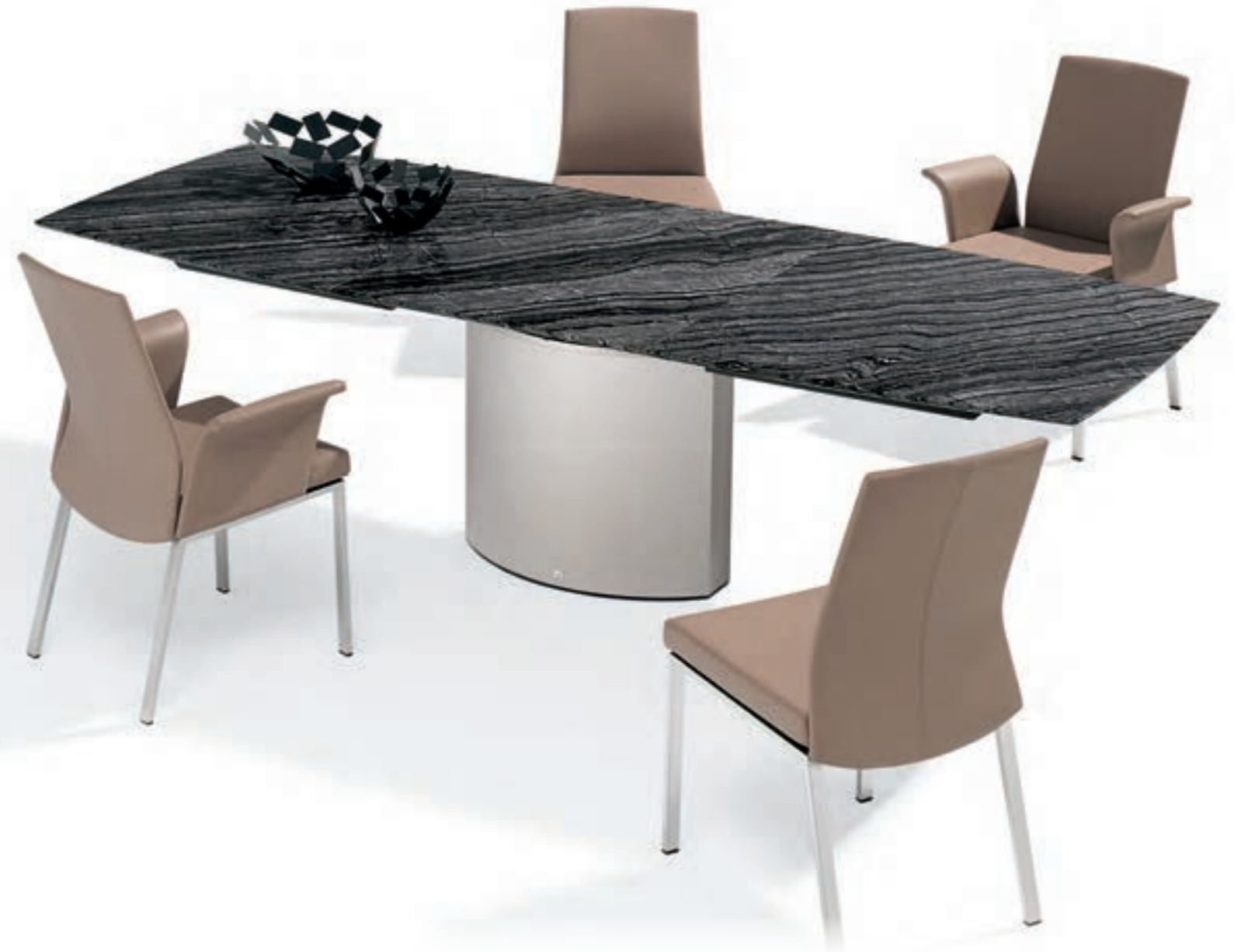
PLATTE: SILVER WAVE (MARMOR), SOCKEL 2, STUHL 2011 LINUS PLATE: SILVER WAVE (MARBLE), BASE 2, CHAIR 2011 LINUS