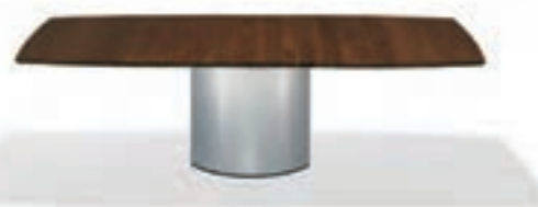
SOCKEL 2 (STANDARD)/BASE 2 (STANDARD)