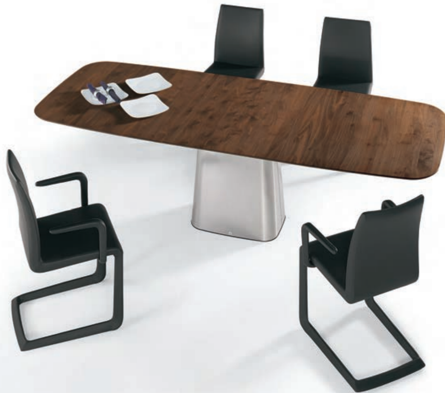
PLATTE: AMERIKANISCH NUSSBAUM (MASSIVHOLZ), SOCKEL 7, STUHL 2068 TALOS PLATE: AMERICAN WALNUT (SOLID WOOD), BASE 7, CHAIR 2068 TALOS