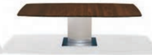
SOCKEL 6/BASE 6