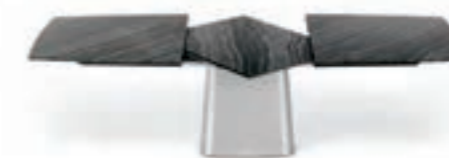
SOCKEL 7/BASE 7