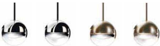
chrome transparent lens chrome satin lens nickel-plated satin transparent lens nickel-plated satin satin lens

halo cod 879 led cod 879L halo cod 880 led cod 880L halo cod 881 led cod 881L halo cod 882 led cod 882L