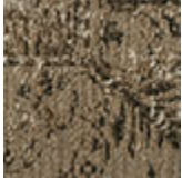
baumwolle und chenille Delhi