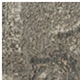
baumwolle und chenille Chennai