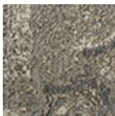
cotton chenille Chennai