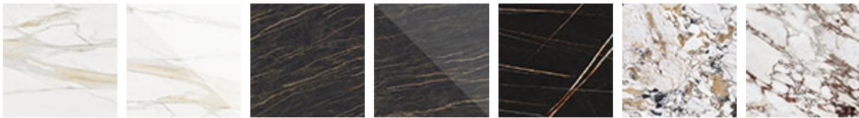
KM05 matt Golden Calacatta