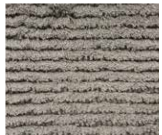
1750 warm grey