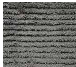
1547 storm grey